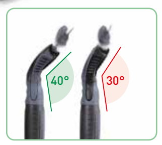
Choose between 40° and 30° head