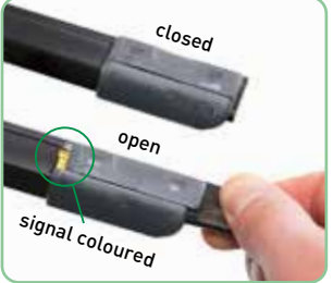
New and improved end clip mechanism