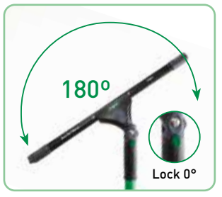
The center position can be locked by pressing the lock button